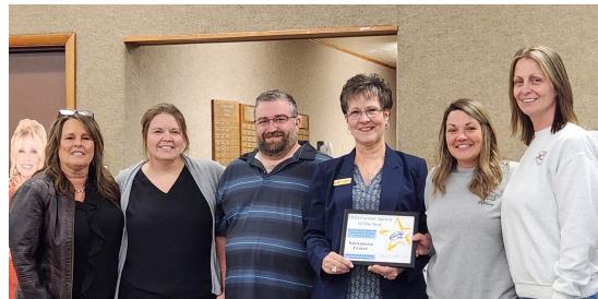
Speranza House 2024 Partner Agency of the Year

2014 Carousel Play & Learn Center 2015 Greensburg Comm. Bread of Life 2016 Decatur County Family YMCA 2020 Agency Partners for COVID efforts 2022 Our Hospice 2023 Community Healthcare Clinic 2024 Speranza House