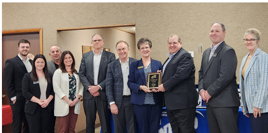
JCBank 2024 Company of the Year